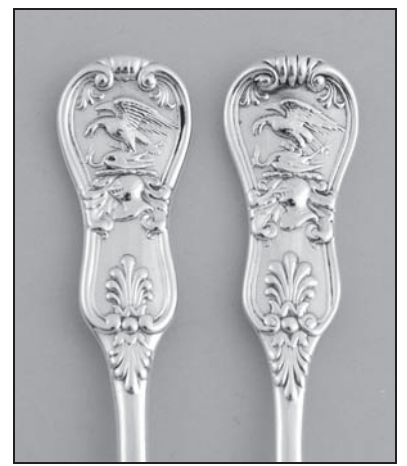
Fig. 35, front of forks by Gray/Chawner

The first example is referred to earlier, and comprises seven dessert forks by Chawner & Co. Figure 35 shows a comparison of examples by Robert Gray & Son of 1837-38 and Chawner & Co of 1865-66. Whilst certainly not identical, the dies are very similar, and it would seem likely that the family wanted additional/replacement pieces, and Chawner's sunk new dies. A comparison is shown in Figures 35 and 36, with the Gray pieces on the left and Chawner on the right.