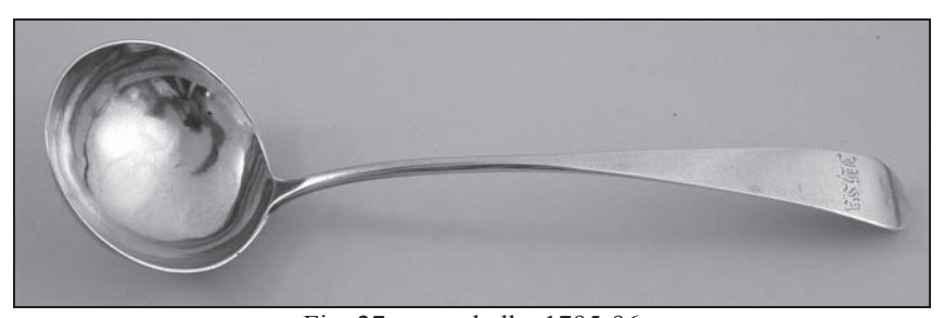
Fig. 27, sauce ladle, 1795-96

Again, there is little to add to what was described for this period in the original paper<sup>1</sup>, except to note that Gray continued to manufacture relatively standard flatware, but frequently with unusually slender stems. This is illustrated by the sauce ladle of 1795-96, illustrated in figure 27. In figure 5, a gravy spoon of 1798-99 was illustrated; the slender stem gives this spoon most elegant proportions, whereas the sauce ladle appears to be rather clumsy – the round bowl seems too large in proportion to the slender stem.