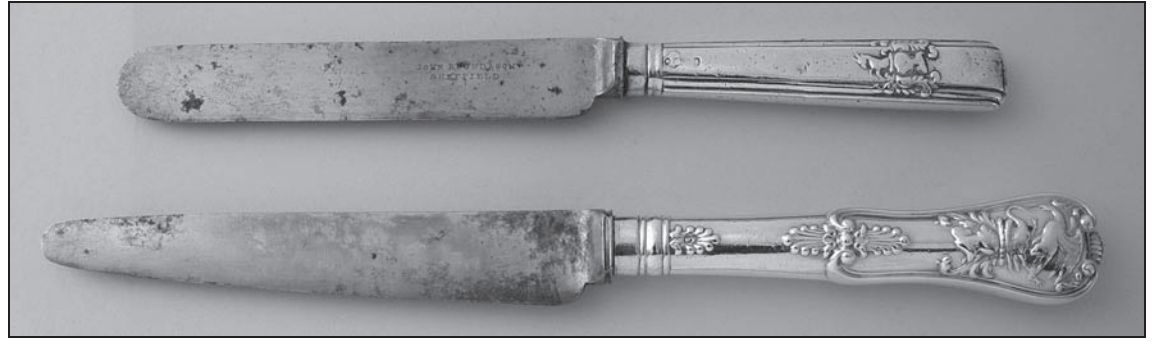
Fig. 33, crested table knives by William Eaton, London, 1833-34 (top), 1837-38 (bottom)