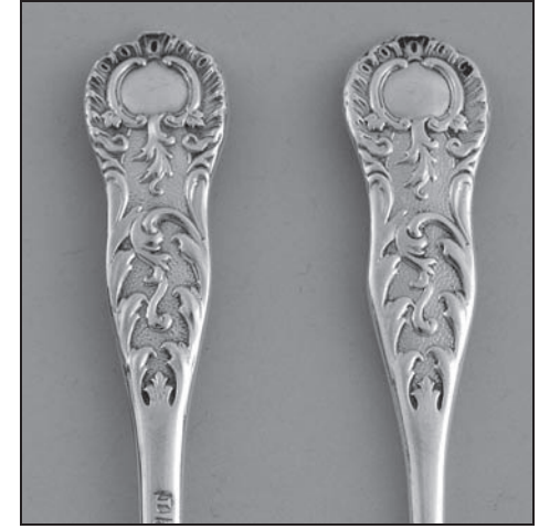
Fig. 38, back of teaspoons by Gray/MSAB