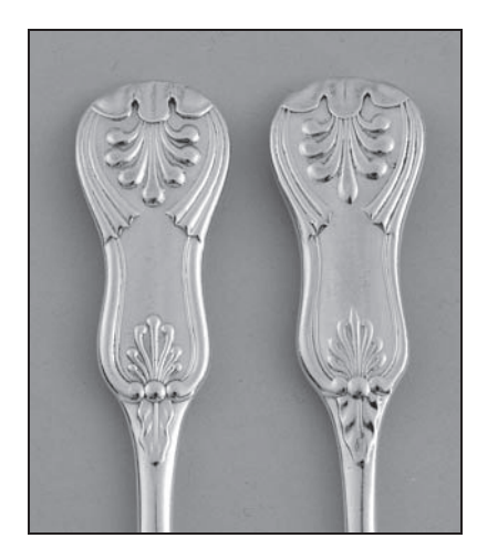
Fig. 36, back of forks by Gray/Chawner

The second example is of two sets of teaspoons of double struck Scottish King's shape (rococo end) teaspoons. These do not have die struck crests; the first set has an engraved Gothic 'B' and is by Robert Gray & Son, 1838-39, and the second has an engraved Gothic 'D' and is by a (so far) unattributed Glasgow maker 'MSAB', 1858-59. A comparison is shown in Figures 37 and 38, with the Gray pieces on the left and those by 'MSAB' on the right. In this case the dies could, possibly, be the same; it is not impossible that 'MSAB' acquired the actual Gray dies after Robert Gray and Son ceased trading in around 1852 or 1853<sup>3</sup>.