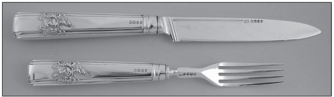
Fig. 34, crested fruit knife and fork by William Eaton, London, 1833-34