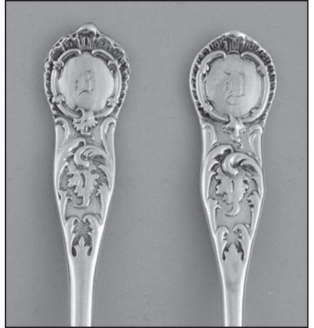
Fig. 37, front of teaspoons by Gray/MSAB