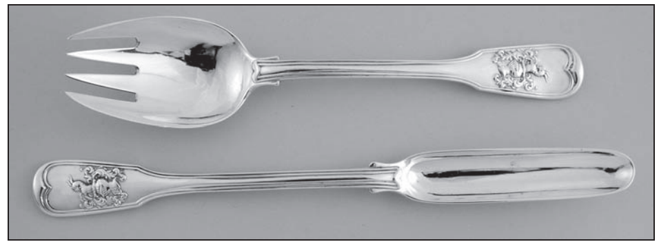
Fig. 32, 'Salad server' and marrow scoop, 1833-34

The third lot comprised five dessert spoons, a single table fork, dessert fork and teaspoon, the pattern and die being identical to Figure 18b. Interestingly, the forks are hallmarked for 1837-38, and all spoons (including toddy ladles previously seen from this die and with this crest) for 1838-39. It is an interesting question why there are two services with essentially the same crest, but of different patterns and some four or five years apart – did two branches of the same family have them, or what?