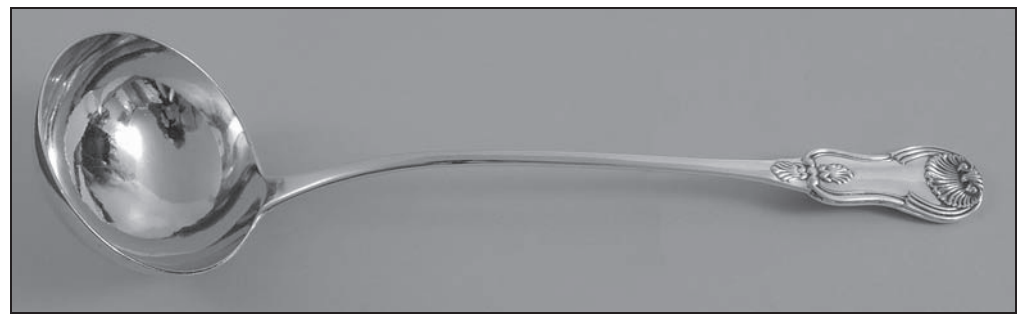
Fig. 30, very heavy gauge soup ladle, 1832-33

An example of the superb quality is the Soup Ladle of 1832-33 shown in Figure 30 - this is essentially the same pattern as the very heavy gravy spoon shown in Figure 15 but, of course, without shoulders, and is even heavier, weighing just under nine troy ounces. Most unusually for a piece of Gray silver it has no engraved initials or crest, and no sign of any erasure (its condition is such that it might never have been used!).