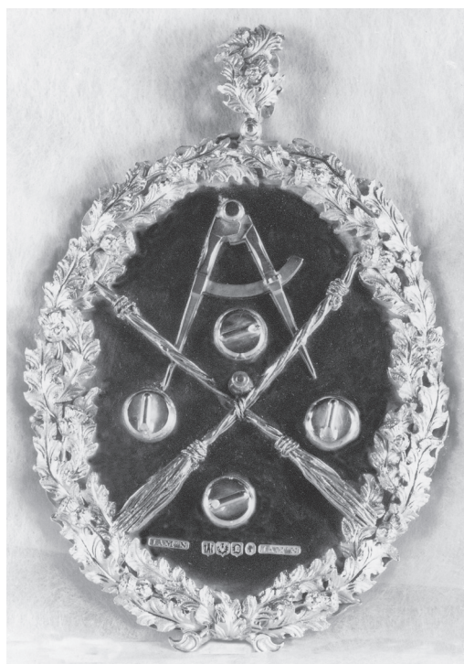
ILLUS 4 Delvine Curling Club, 1846

The club was instituted in 1732 and joined the RCCC in 1842. The medal is in the possession of Delvine Curling Club.