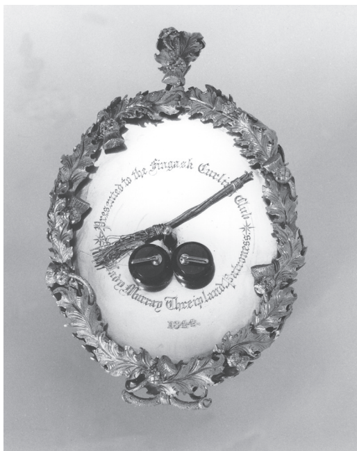
ILLUS 3 Fingask Curling Club, 1844

(duty mark); thistle (standard mark); castle (Edinburgh); 'M' (date letter for 1843–4). It is 12.5cm × 8cm.