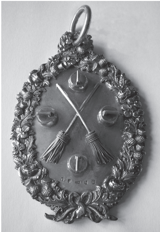
ILLUS 5 Alva Curling Club, 1853

The club was formed in 1848 and joined the RCCC the following year. The medal is in the author's collection.