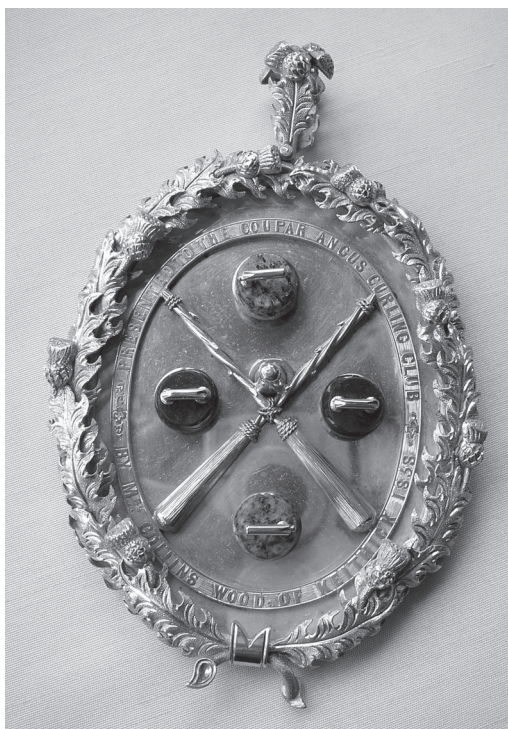
ILLUS 8 Coupar Angus Curling Club, 1858