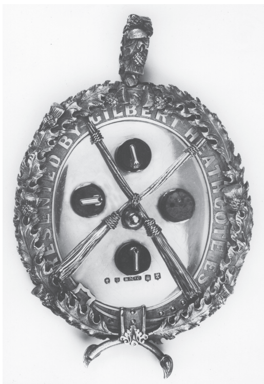
ILLUS 7 Drummond Castle Curling Club, 1854

On the obverse is a band of gold recording the donation, within which are set two pairs of miniature curling stones: one pair of bloodstone with double handles of gold, and the other of granitic stone (said to be from the walls of Sebastopol) 10 with L-shaped handles of gold, with crossed brooms of gold, and a gold tee-marker. The inscription is as follows.