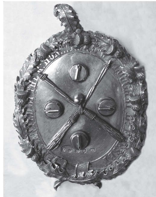
ILLUS 6 Drummond Castle Curling Club, 1853

The marks on the obverse are: queen's head (duty mark); thistle (standard mark); JS (maker's mark); castle (Edinburgh); 'W' (date letter for 1853–4). It is 12.5cm × 8cm. The medal is in the author's collection.