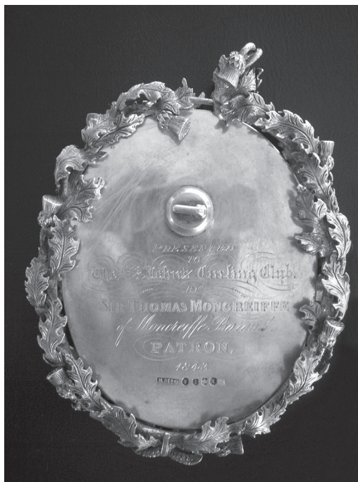
ILLUS 1 St John's Curling Club, Perth, 1842

On the obverse, above the presentation inscription, is a miniature silver curling stone, with an L-shaped handle. 5 The inscription is as follows.