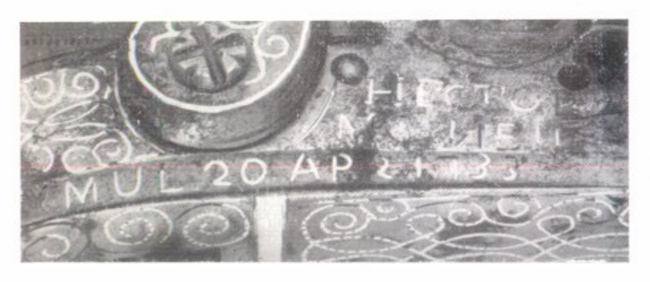
b Detail of above