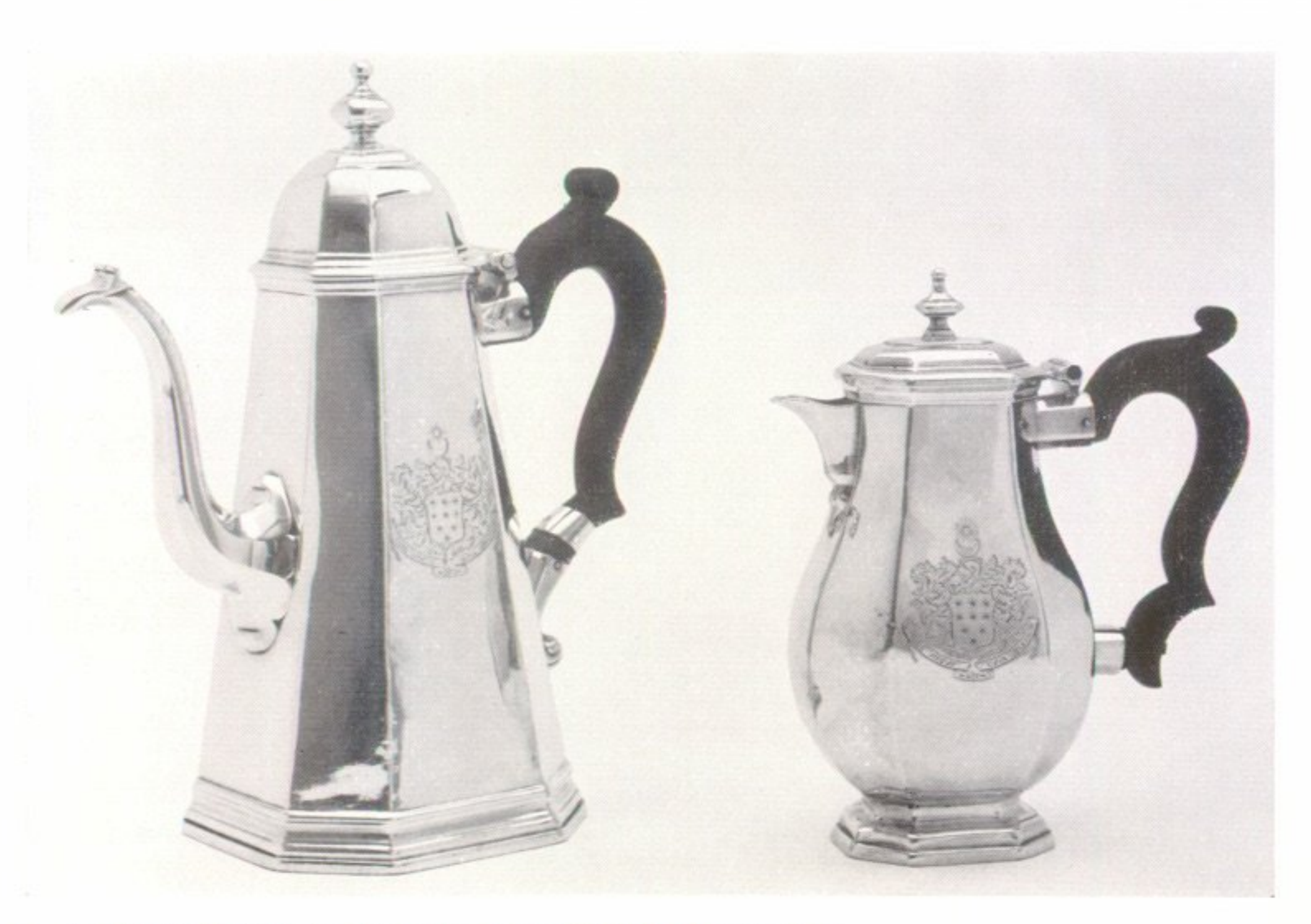
c A silver coffee-pot and hot milk jug by Colin McKenzie, 1713