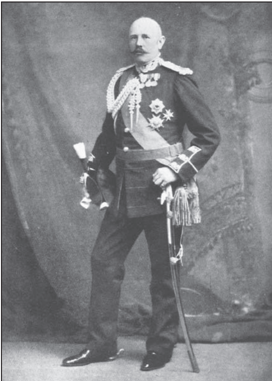
Gavin Campbell 1 st Marquess and 7 th Earl of Breadalbane.

Rightly, much weight is given to provenance in collecting silver; however the relatively young subject of Scottish silver makes this more difficult than in many other fields. While provenances are available they often only go as far back as the 'early sales' of Scottish and provincial silver in the 1980s. Indeed many of the larger London auctions seem not to have handled Scottish silver separately or catalogued it in the main sales until the 1950s and 1960s, unless highly important early objects. Indeed it is this unknown of Scottish silver that has often been its allure and collectiveness from the earliest collectors to the current.