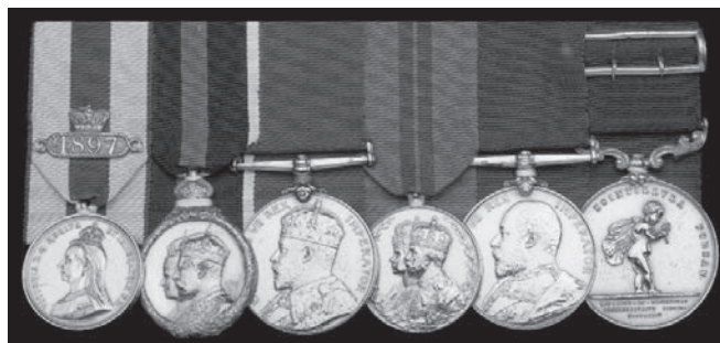
Medal group, comprising 1887 Queen Victorian Golden jubilee medal with 1897 Diamond jubilee bar, Edward VII 1902 Coronation medal, Edward VII 1903 Visit to Scotland Medal, George V and Queen Mary 1911 Coronation medal, Edward VII Volunteer Force medal, Royal Humane Society silver medal.

In 1893 he was created a Knight of the Garter and was also a Knight of Justice of the Order of St. John and a Knight of the Swedish Order of the Seraphim.